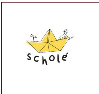
PROJETO SCHOLE LDA