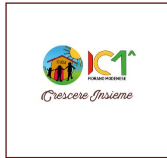
INSTITUTO COMPRESIVO FIORANO 1