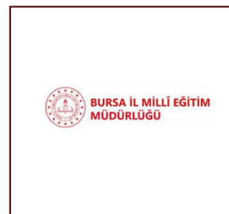
Bursa İl Millî Eğitim Mudurlugu