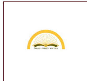
SIAULIU "DERMES" MOKYKLA