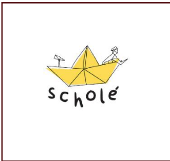
PROJETO SCHOLE LDA