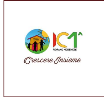
ISTITUTO COMPRESIVO FIORANO 1