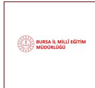
Bursa İl Milli Eğitim Mudurlugu